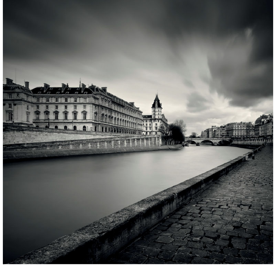
Île de la Cité