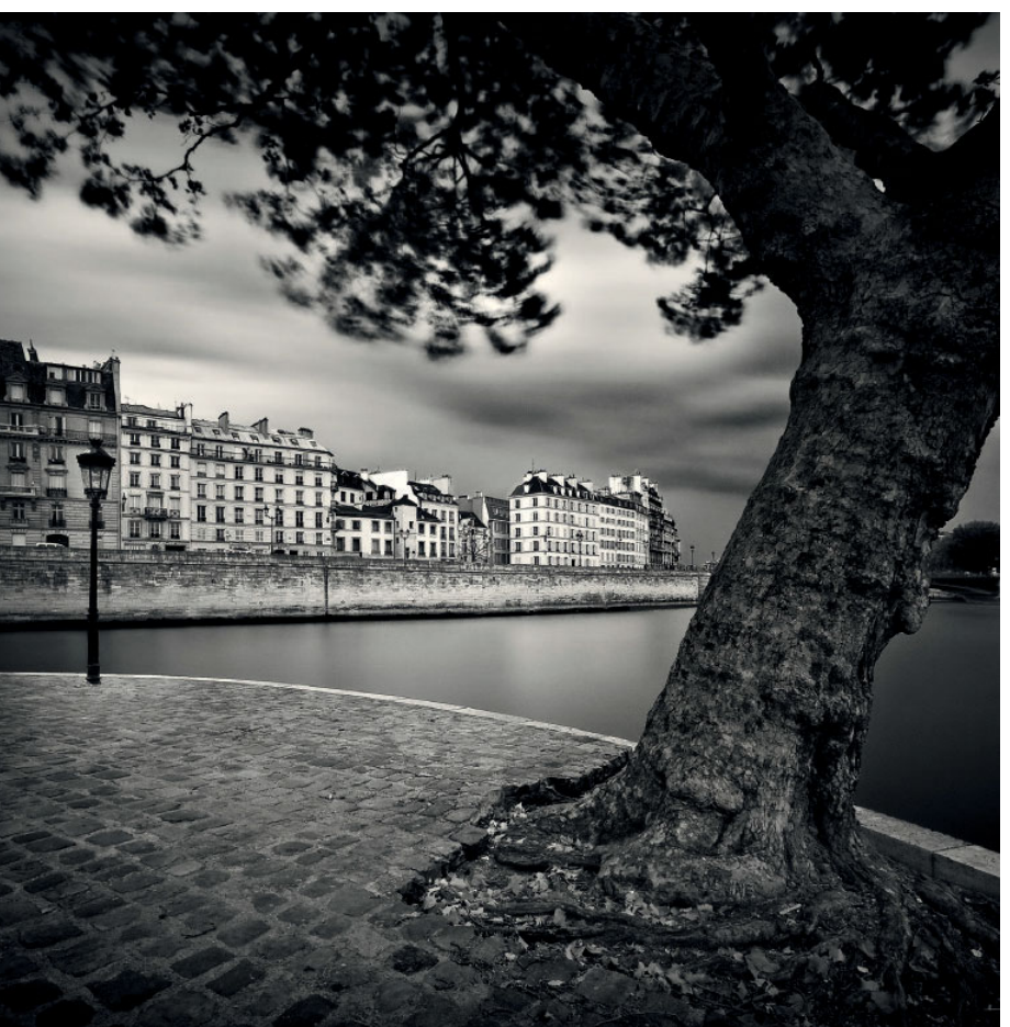
Île de la Cité

he city of Paris is steeped in the language of love; from its buildings to the smell of freshly baked baguettes. It's hard not to want to capture the essence of a place that whispers 'l'amour'. Black and white photographer Damien Vassart has done just that in his latest, beautifully rich series of images. He spoke to Jade Price about capturing the city of love in one of the most romantic photographic genres.