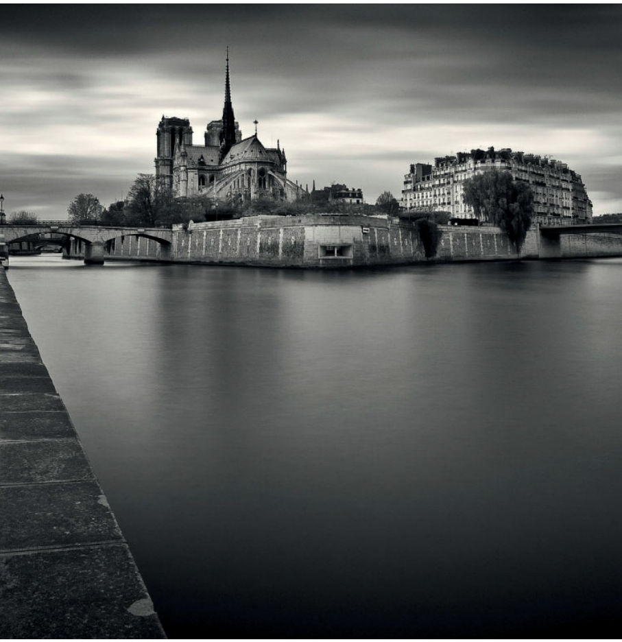
Île de la Cité