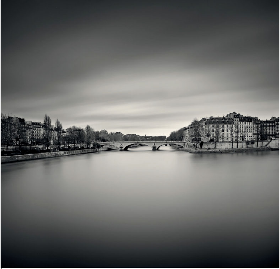
Île Saint Louis