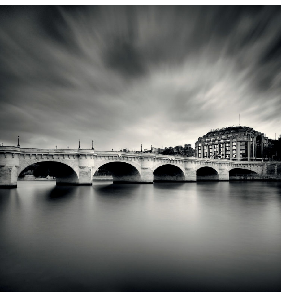
La Samaritaine - Pont Neuf

enhances the quality of light. The mood is also more intimate, more romantic in these places, and that is an important factor for me when I shoot.