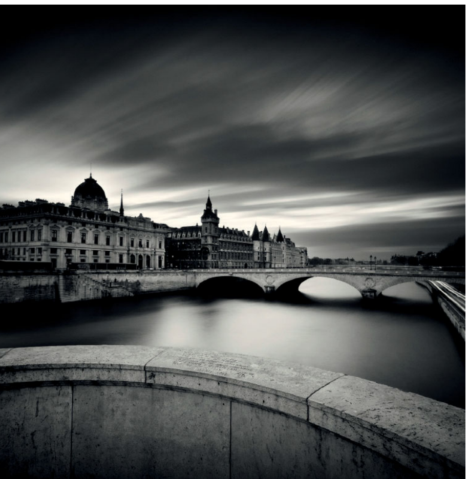
Île de la Cité